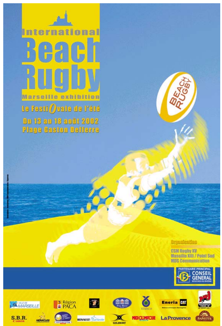
POSTER OF THE 2002 EDITION